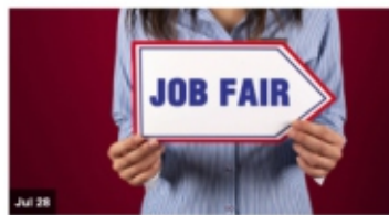
USAG Benelux Employment and Career Expo